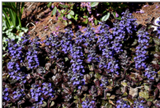
Black Scallop Bugleweed in bloom

Black Scallop Bugleweed is a fine choice for the garden, but it is also a good selection for planting in outdoor containers and hanging baskets. Because of its spreading habit of growth, it is ideally suited for use as a 'spiller' in the 'spiller-thriller-filler' container combination; plant it near the edges where it can spill gracefully over the pot. Note that when growing plants in outdoor containers and baskets, they may require more frequent waterings than they would in the yard or garden.