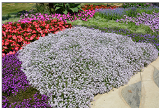
Blushing Princess Sweet Alyssum in bloom

Blushing Princess Sweet Alyssum is a fine choice for the garden, but it is also a good selection for planting in hanging baskets. Because of its trailing habit of growth, it is ideally suited for use as a 'spiller' in the 'spiller-thriller-filler' container combination; plant it near the edges where it can spill gracefully over the pot. Note that when growing plants in outdoor containers and baskets, they may require more frequent waterings than they would in the yard or garden.