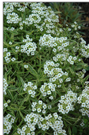
Frosty Knight Alyssum flowers

Frosty Knight Alyssum is recommended for the following landscape applications;