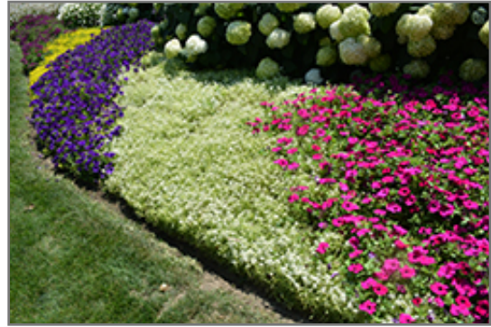
Frosty Knight Alyssum in bloom

Frosty Knight Alyssum is a fine choice for the garden, but it is also a good selection for planting in hanging baskets. Because of its trailing habit of growth, it is ideally suited for use as a 'spiller' in the 'spiller-thriller-filler' container combination; plant it near the edges where it can spill gracefully over the pot. Note that when growing plants in outdoor containers and baskets, they may require more frequent waterings than they would in the yard or garden.