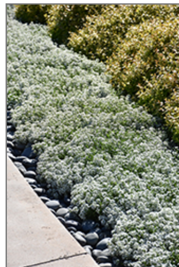
Snow Princess Alyssum in bloom

Snow Princess Alyssum is recommended for the following landscape applications;