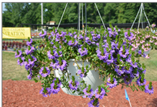
Bombay Dark Blue Fan Flower in bloom