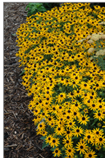
Little Goldstar Coneflower in bloom

Little Goldstar Coneflower is a fine choice for the garden, but it is also a good selection for planting in outdoor pots and containers. It is often used as a 'filler' in the 'spiller-thriller-filler' container combination, providing a mass of flowers against which the larger thriller plants stand out. Note that when growing plants in outdoor containers and baskets, they may require more frequent waterings than they would in the yard or garden.