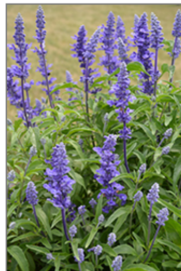
Victoria Blue Salvia flowers

Victoria Blue Salvia is recommended for the following landscape applications;