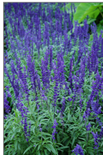
Victoria Blue Salvia flowers

Victoria Blue Salvia is a fine choice for the garden, but it is also a good selection for planting in outdoor pots and containers. With its upright habit of growth, it is best suited for use as a 'thriller' in the 'spiller-thriller-filler' container combination; plant it near the center of the pot, surrounded by smaller plants and those that spill over the edges. Note that when growing plants in outdoor containers and baskets, they may require more frequent waterings than they would in the yard or garden.