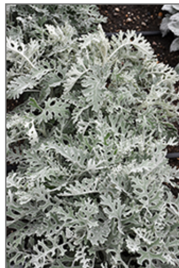
Silver Dust Dusty Miller foliage

Silver Dust Dusty Miller is a fine choice for the garden, but it is also a good selection for planting in outdoor containers and hanging baskets. It is often used as a 'filler' in the 'spiller-thriller-filler' container combination, providing a mass of flowers and foliage against which the larger thriller plants stand out. Note that when growing plants in outdoor containers and baskets, they may require more frequent waterings than they would in the yard or garden.