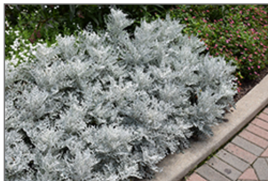
Silver Dust Dusty Miller

Silver Dust Dusty Miller is recommended for the following landscape applications;