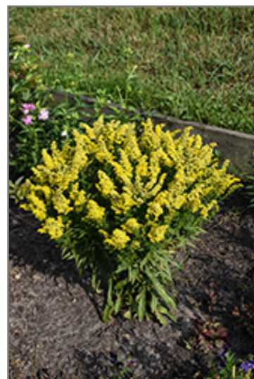
Little Lemon Goldenrod in bloom