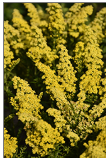
Little Lemon Goldenrod flowers

Little Lemon Goldenrod is recommended for the following landscape applications;