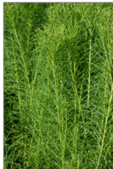
Narrowleaf Ironweed foliage