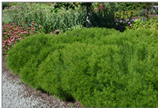
Narrowleaf Ironweed