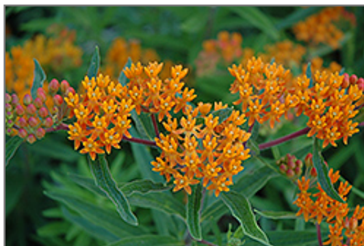
Gay Butterflies Butterfly Weed flowers