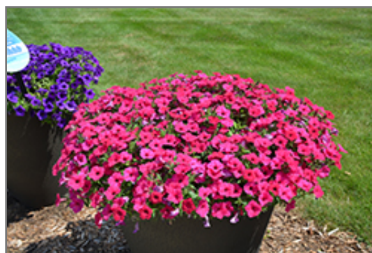
Supertunia Royal Magenta Petunia in bloom