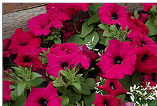
Supertunia Royal Magenta Petunia flowers