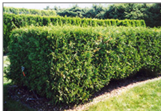
Techny Arborvitae