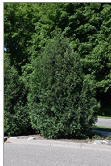
Techny Arborvitae