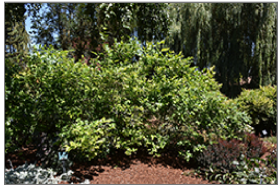
Northland Blueberry