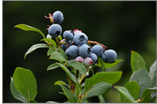
Northland Blueberry fruit