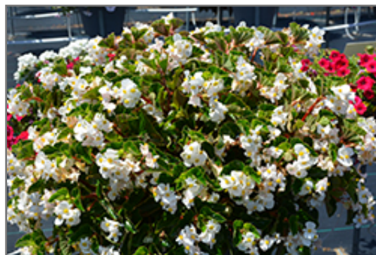
BabyWing White Begonia in bloom

BabyWing White Begonia is a fine choice for the garden, but it is also a good selection for planting in outdoor containers and hanging baskets. It is often used as a 'filler' in the 'spiller-thriller-filler' container combination, providing a mass of flowers and foliage against which the thriller plants stand out. Note that when growing plants in outdoor containers and baskets, they may require more frequent waterings than they would in the yard or garden.