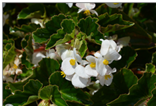
BabyWing White Begonia flowers