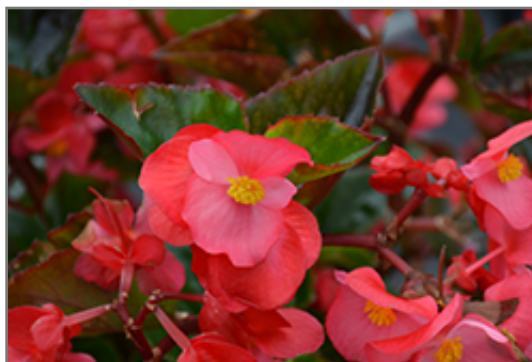
Big Rose Green Leaf Begonia flowers