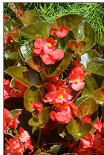
Big Red Bronze Leaf Begonia flowers

This is a high maintenance plant that will require regular care and upkeep, and usually looks its best without pruning, although it will tolerate pruning. Deer don't particularly care for this plant and will usually leave it alone in favor of tastier treats. Gardeners should be aware of the following characteristic(s) that may warrant special consideration;