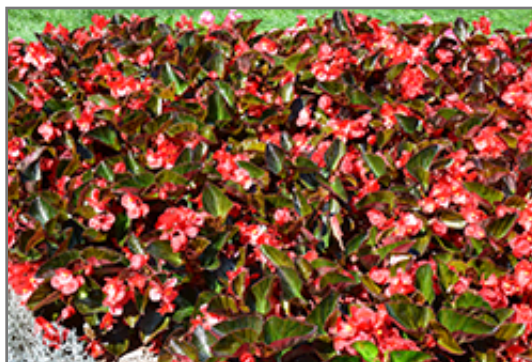
Big Red Bronze Leaf Begonia in bloom

Big Red Bronze Leaf Begonia is a fine choice for the garden, but it is also a good selection for planting in outdoor containers and hanging baskets. It is often used as a 'filler' in the 'spiller-thriller-filler' container combination, providing a mass of flowers and foliage against which the larger thriller plants stand out. Note that when growing plants in outdoor containers and baskets, they may require more frequent waterings than they would in the yard or garden.