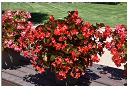
Whopper Red Bronze Leaf Begonia flowers