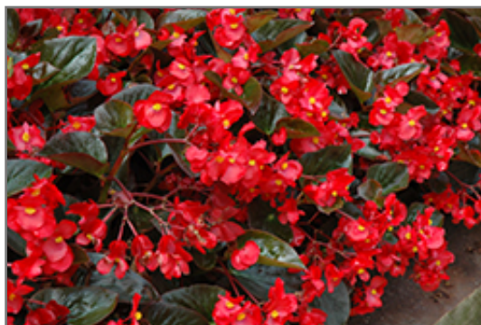
Whopper Red Bronze Leaf Begonia flowers

This is a high maintenance plant that will require regular care and upkeep, and usually looks its best without pruning, although it will tolerate pruning. Deer don't particularly care for this plant and will usually leave it alone in favor of tastier treats. Gardeners should be aware of the following characteristic(s) that may warrant special consideration;