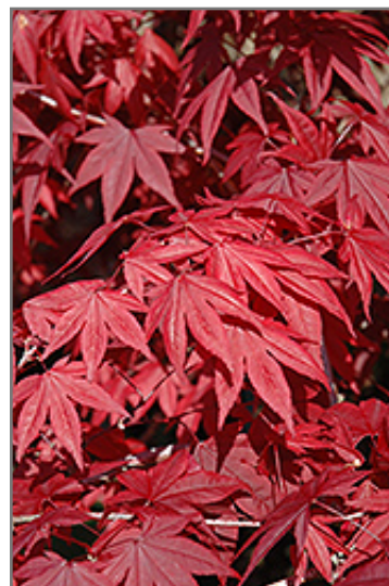
Emperor I Japanese Maple foliage

This tree does best in full sun to partial shade. You may want to keep it away from hot, dry locations that receive direct afternoon sun or which get reflected sunlight, such as against the south side of a white wall. It prefers to grow in average to moist conditions, and shouldn't be allowed to dry out. It is not particular as to soil pH, but grows best in rich soils. It is somewhat tolerant of urban pollution, and will benefit from being planted in a relatively sheltered location. Consider applying a thick mulch around the root zone in winter to protect it in exposed locations or colder microclimates. This is a selected variety of a species not originally from North America.