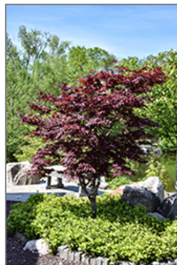
Emperor I Japanese Maple