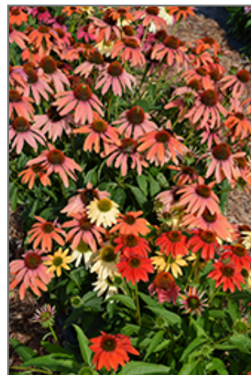
Cheyenne Spirit Coneflower in bloom

This is a relatively low maintenance plant, and is best cleaned up in early spring before it resumes active growth for the season. It is a good choice for attracting butterflies to your yard, but is not particularly attractive to deer who tend to leave it alone in favor of tastier treats. It has no significant negative characteristics.