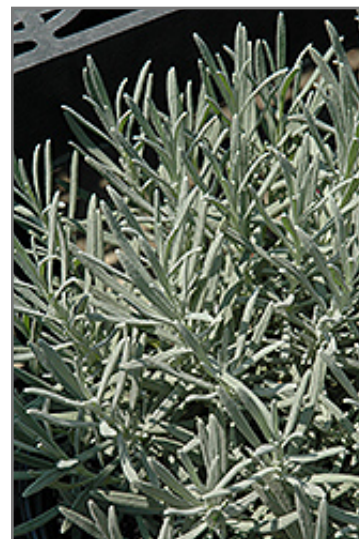
Phenomenal Lavender foliage

Phenomenal Lavender makes a fine choice for the outdoor landscape, but it is also well-suited for use in outdoor pots and containers. Because of its height, it is often used as a 'thriller' in the 'spiller-thriller-filler' container combination; plant it near the center of the pot, surrounded by smaller plants and those that spill over the edges. It is even sizeable enough that it can be grown alone in a suitable container. Note that when grown in a container, it may not perform exactly as indicated on the tag - this is to be expected. Also note that when growing plants in outdoor containers and baskets, they may require more frequent waterings than they would in the yard or garden.