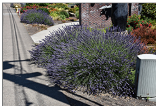
Phenomenal Lavender in bloom

This is a relatively low maintenance shrub, and can be pruned at anytime. It is a good choice for attracting butterflies to your yard, but is not particularly attractive to deer who tend to leave it alone in favor of tastier treats. It has no significant negative characteristics.