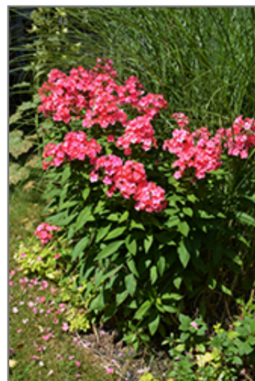
Flame Coral Garden Phlox in bloom