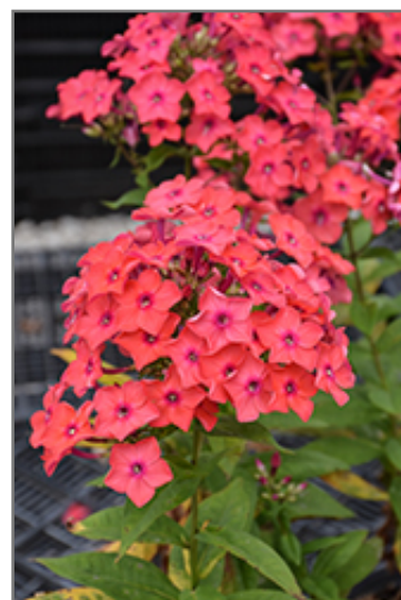
Flame Coral Garden Phlox flowers