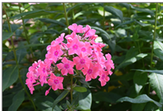
Flame Light Pink Garden Phlox flowers