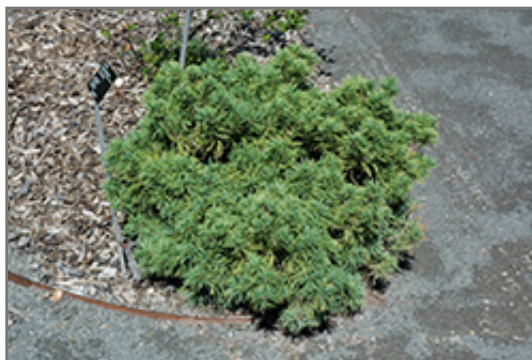
Mini Twists White Pine

This shrub should only be grown in full sunlight. It is very adaptable to both dry and moist growing conditions, but will not tolerate any standing water. It is not particular as to soil type, but has a definite preference for acidic soils, and is subject to chlorosis (yellowing) of the foliage in alkaline soils. It is quite intolerant of urban pollution, therefore inner city or urban streetside plantings are best avoided, and will benefit from being planted in a relatively sheltered location. This is a selection of a native North American species.