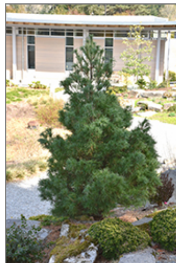
Mini Twists White Pine