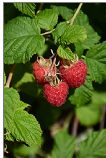
Raspberry Shortcake Raspberry fruit

Raspberry Shortcake Raspberry has rich green deciduous foliage on a plant with an upright spreading habit of growth. The textured oval compound leaves do not develop any appreciable fall color. It features an abundance of magnificent red berries in mid summer.