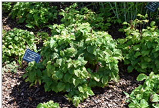
Raspberry Shortcake Raspberry

Raspberry Shortcake Raspberry is a good choice for the edible garden, but it is also well-suited for use in outdoor pots and containers. With its upright habit of growth, it is best suited for use as a 'thriller' in the 'spiller-thriller-filler' container combination; plant it near the center of the pot, surrounded by smaller plants and those that spill over the edges. It is even sizeable enough that it can be grown alone in a suitable container. Note that when grown in a container, it may not perform exactly as indicated on the tag - this is to be expected. Also note that when growing plants in outdoor containers and baskets, they may require more frequent waterings than they would in the yard or garden.