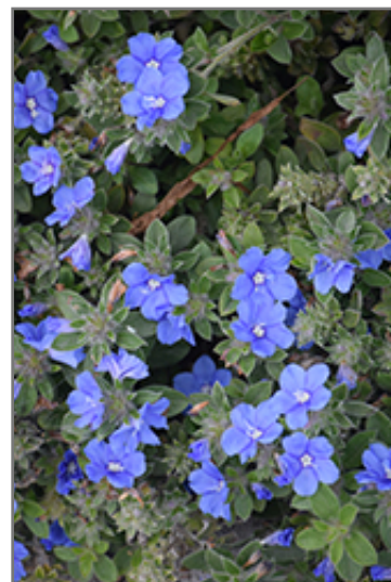
Blue My Mind Morning Glory flowers

Blue My Mind Morning Glory is recommended for the following landscape applications;