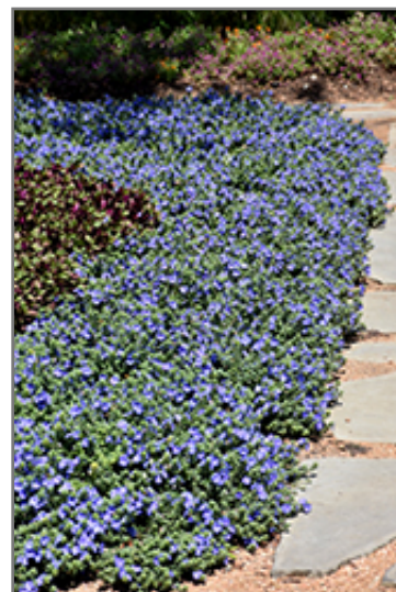
Blue My Mind Morning Glory in bloom

Blue My Mind Morning Glory is recommended for the following landscape applications;