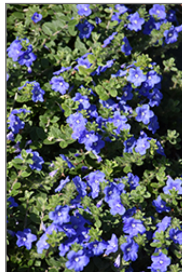
Blue My Mind Morning Glory flowers