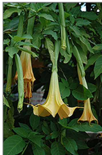
Golden Angel's Trumpet flowers

Golden Angel's Trumpet is recommended for the following landscape applications;