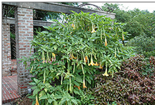
Golden Angel's Trumpet in bloom