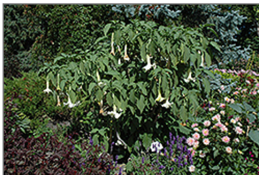
White Angel's Trumpet in bloom