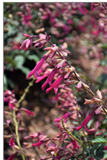
Wendy's Wish Sage flowers

Wendy's Wish Sage is recommended for the following landscape applications;