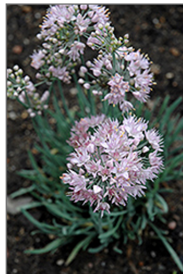
Blue Eddy Ornamental Onion flowers

Blue Eddy Ornamental Onion is recommended for the following landscape applications;