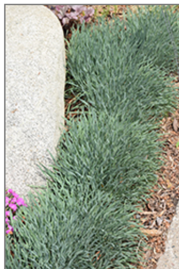
Blue Eddy Ornamental Onion