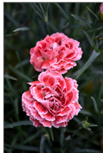
Coral Reef Pinks flowers

Coral Reef Pinks is recommended for the following landscape applications;