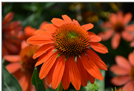
Sombrero Adobe Orange Coneflower flowers

Sombrero Adobe Orange Coneflower will grow to be about 24 inches tall at maturity, with a spread of 18 inches. Its foliage tends to remain dense right to the ground, not requiring facer plants in front. It grows at a medium rate, and under ideal conditions can be expected to live for approximately 10 years. As an herbaceous perennial, this plant will usually die back to the crown each winter, and will regrow from the base each spring. Be careful not to disturb the crown in late winter when it may not be readily seen!