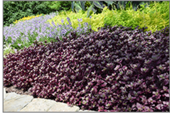
Purple Knight Alternanthera

Purple Knight Alternanthera will grow to be about 12 inches tall at maturity, with a spread of 12 inches. Its foliage tends to remain dense right to the ground, not requiring facer plants in front. Although it's not a true annual, this plant can be expected to behave as an annual in our climate if left outdoors over the winter, usually needing replacement the following year. As such, gardeners should take into consideration that it will perform differently than it would in its native habitat.