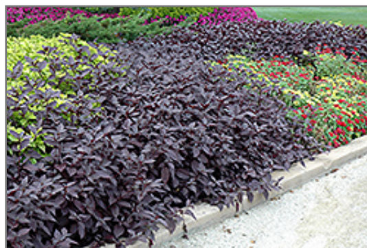
Purple Knight Alternanthera