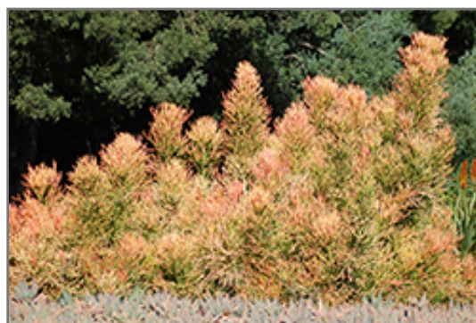
Sticks On Fire Red Pencil Tree