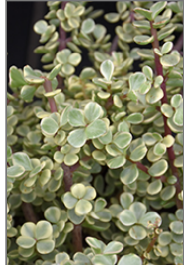
Variegated Elephant Food foliage