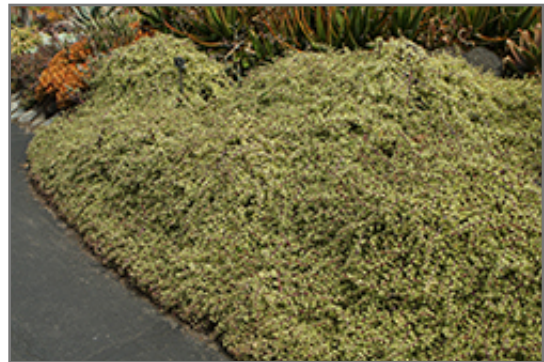
Variegated Elephant Food