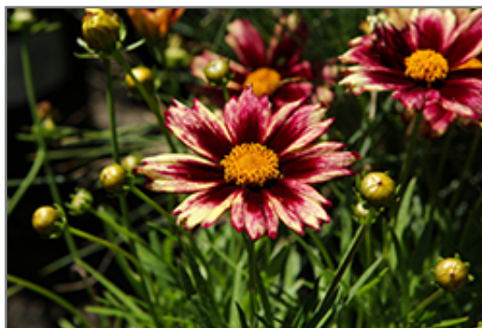
Starlight Tickseed flowers

Starlight Tickseed will grow to be about 8 inches tall at maturity extending to 12 inches tall with the flowers, with a spread of 16 inches. Its foliage tends to remain low and dense right to the ground. It grows at a medium rate, and under ideal conditions can be expected to live for approximately 10 years. As an herbaceous perennial, this plant will usually die back to the crown each winter, and will regrow from the base each spring. Be careful not to disturb the crown in late winter when it may not be readily seen!