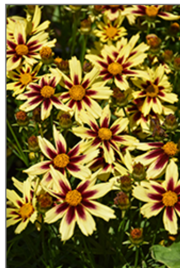
Starlight Tickseed flowers