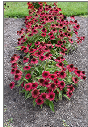
Sombrero Baja Burgundy Coneflower in bloom