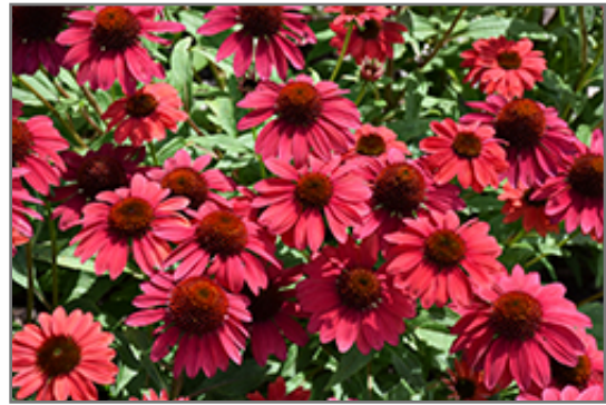
Sombrero Baja Burgundy Coneflower flowers

This is a relatively low maintenance plant, and is best cleaned up in early spring before it resumes active growth for the season. It is a good choice for attracting butterflies to your yard, but is not particularly attractive to deer who tend to leave it alone in favor of tastier treats. It has no significant negative characteristics.