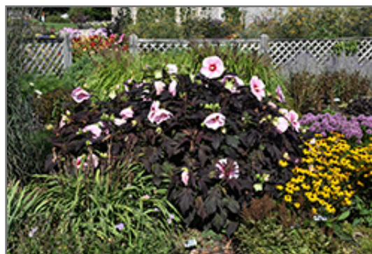
Starry Starry Night Hibiscus in bloom