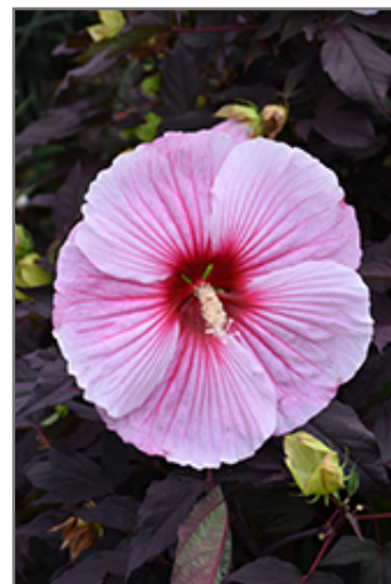
Starry Starry Night Hibiscus flowers

This plant will require occasional maintenance and upkeep, and should be cut back in late fall in preparation for winter. It is a good choice for attracting butterflies and hummingbirds to your yard, but is not particularly attractive to deer who tend to leave it alone in favor of tastier treats. Gardeners should be aware of the following characteristic(s) that may warrant special consideration;