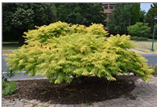
Tiger Eyes Sumac