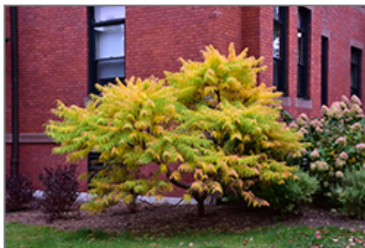
Tiger Eyes Sumac in fall