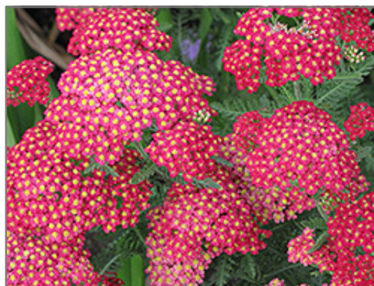
Galaxy Paprika Yarrow flowers

Galaxy Paprika Yarrow is recommended for the following landscape applications;