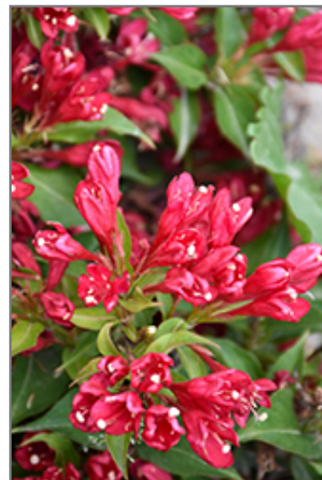
Crimson Kisses Weigela flowers