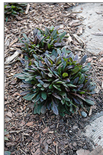
Chocolate Chip Bugleweed