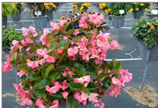
Big Pink Green Leaf Begonia in bloom

Big Pink Green Leaf Begonia is a fine choice for the garden, but it is also a good selection for planting in outdoor containers and hanging baskets. It is often used as a 'filler' in the 'spiller-thriller-filler' container combination, providing a mass of flowers and foliage against which the larger thriller plants stand out. Note that when growing plants in outdoor containers and baskets, they may require more frequent waterings than they would in the yard or garden.