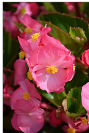
Big Pink Green Leaf Begonia flowers

This is a high maintenance plant that will require regular care and upkeep, and usually looks its best without pruning, although it will tolerate pruning. Deer don't particularly care for this plant and will usually leave it alone in favor of tastier treats. Gardeners should be aware of the following characteristic(s) that may warrant special consideration;