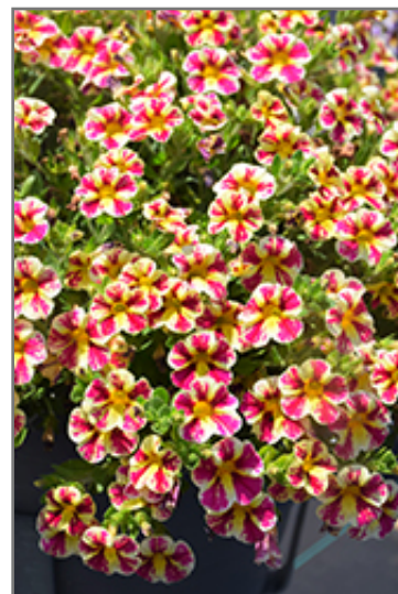
Superbells Holy Moly! Calibrachoa flowers

This plant will require occasional maintenance and upkeep. Trim off the flower heads after they fade and die to encourage more blooms late into the season. It is a good choice for attracting bees and hummingbirds to your yard, but is not particularly attractive to deer who tend to leave it alone in favor of tastier treats. It has no significant negative characteristics.