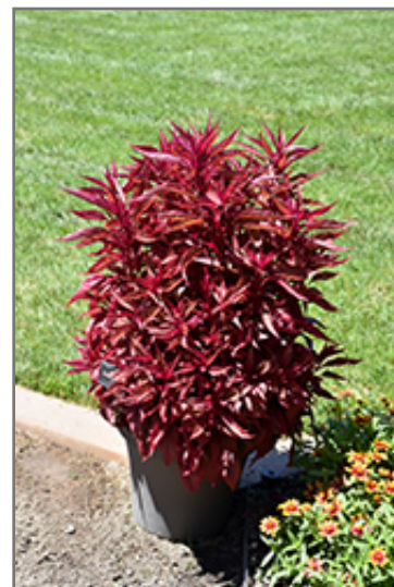
Dragon's Breath Plumed Celosia

Dragon's Breath Plumed Celosia will grow to be about 20 inches tall at maturity, with a spread of 16 inches. When grown in masses or used as a bedding plant, individual plants should be spaced approximately 12 inches apart. Its foliage tends to remain dense right to the ground, not requiring facer plants in front. This fast-growing annual will normally live for one full growing season, needing replacement the following year.