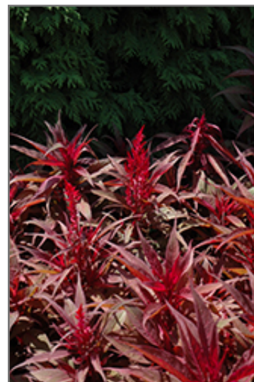
Dragon's Breath Plumed Celosia flowers

This plant will require occasional maintenance and upkeep, and should be cut back in late fall in preparation for winter. It is a good choice for attracting butterflies to your yard, but is not particularly attractive to deer who tend to leave it alone in favor of tastier treats. It has no significant negative characteristics.