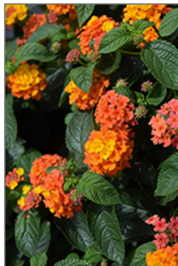
Lucky Flame Lantana flowers

Lucky Flame Lantana is recommended for the following landscape applications;