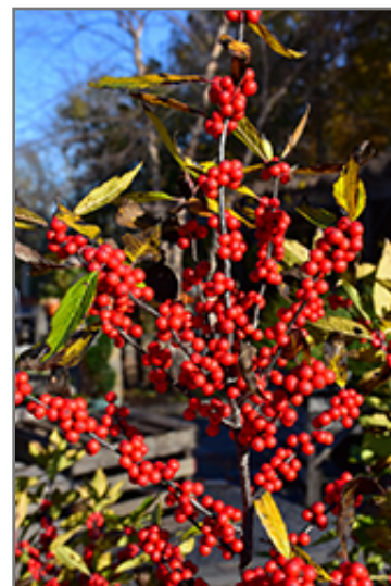
Winterberry fruit

Winterberry is recommended for the following landscape applications;