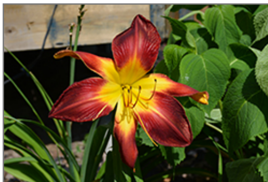
Rainbow Rhythm Ruby Spider Daylily flowers