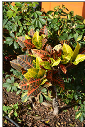
Variegated Croton