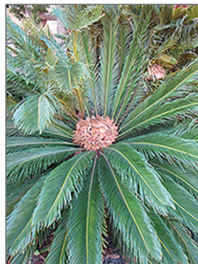
Japanese Sago Palm in bloom