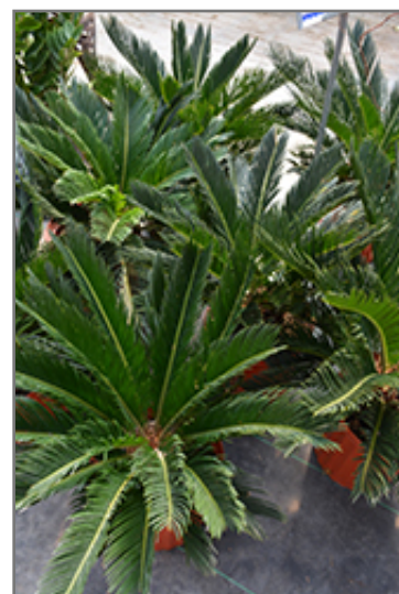
Japanese Sago Palm

This is a multi-stemmed evergreen houseplant with a shapely form and gracefully arching foliage. Its relatively fine texture sets it apart from other indoor plants with less refined foliage. This plant should not require much pruning, except when necessary to keep it looking its best.